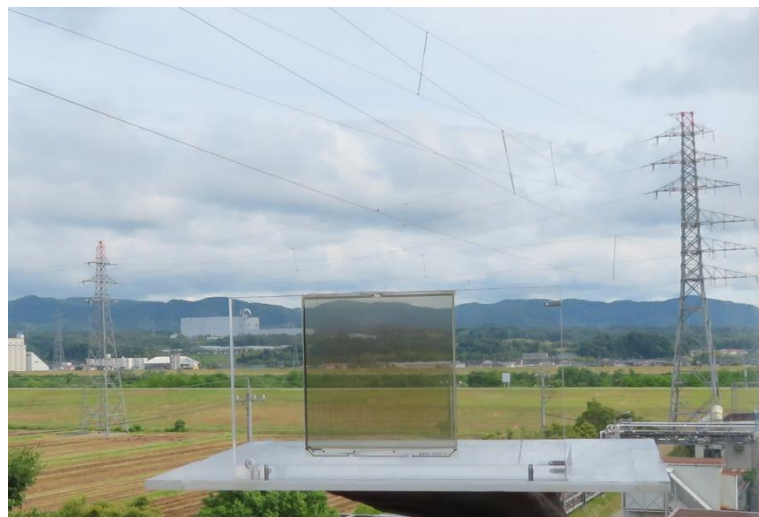
Fig.1 Small prototype of transparent liquid crystal meta-surface reflector for mmWave.

Japan Display Inc. today announced the development of the world's first transparent liquid crystal meta-surface reflector that can change the direction of mmWave reflection to any direction. The transparent liquid crystal meta-surface reflector can be placed on window glass or on advertising media, and generally in any environment or location where transparency offers added benefits, which greatly increases installation flexibility. As a result, the radio communication environment of mmWave is greatly improved, contributing to greater convenience for consumers.