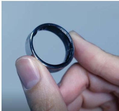
Virgo Smart Ring