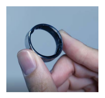
Virgo Smart Ring