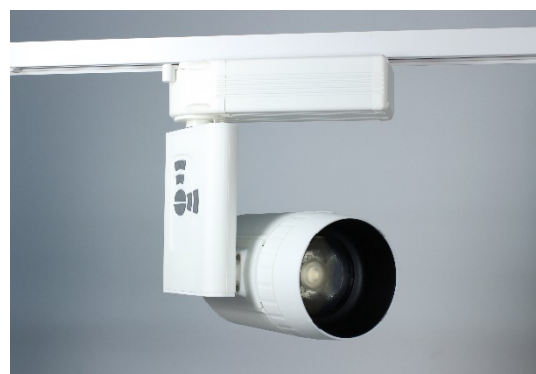
First LumiFree Device (TOKI CORPORATION)